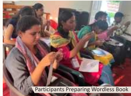
Participants Preparing Wordless Book