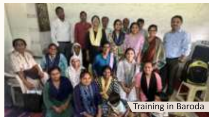
Training in Baroda

MACHILIPATNAM- The training was attended by 55 participants and frankly speaking it was one of the best groups that we trained. They