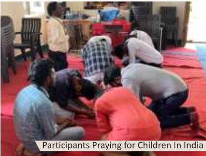
Participants Praying for Children In India

The children were attentive throughout and responded positively during worship and ministry time.